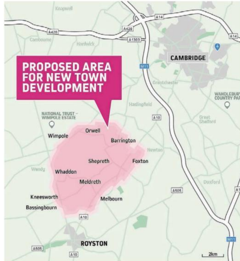
An indication of the potential scale of Thakeham's proposed development by the campaign group. Thakeham has not divulged the precise boundaries

No formal plans have yet been submitted. The government has said South Cambridgeshire District Council will determine the proposals as the planning authority.